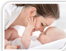
How others relate to me Forms Identity: I Am LOVED

Sometimes our _____ in Faith Formation do not align with our _____.