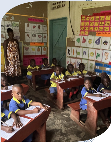
Class of students at the Capuchin-run St. Felix Nursery School in Kabbega, Uganda