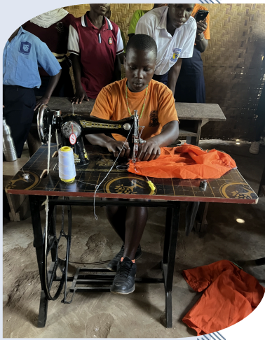
A young girl in Uganda learns sewing skills in vocational training program