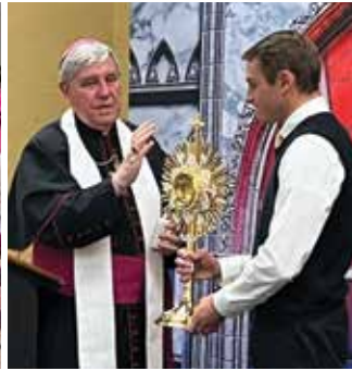
Archbishop Jerome E. ListECKi blesses a monstrance purchased by a donor for a traveling sacristy.