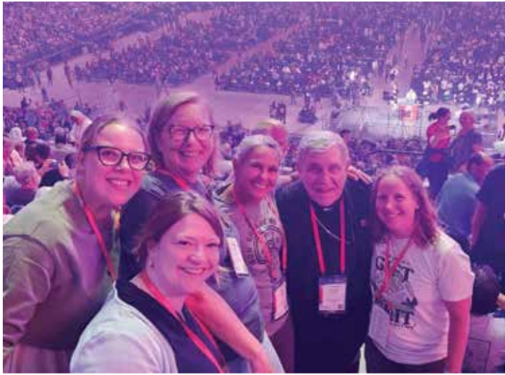
Archbishop Jerome ListECKi visits with members of St. Leonard, Muskego, in Lucas Oil Stadium in Indianapolis before one of the nightly revival sessions at the National Eucharistic Congress.