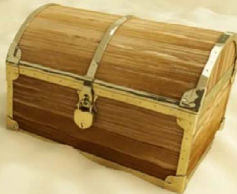
August 23 is Memorial Saint Day of St. Rose of Lima.