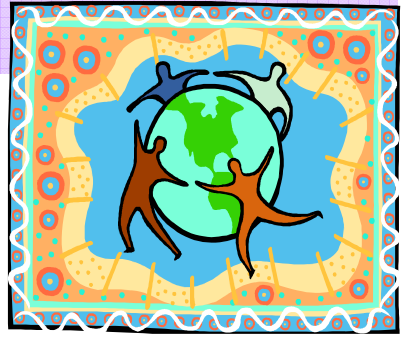
Loving God and neighbor in ways that bear fruit in the life of society.