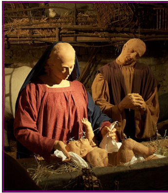
Nativity Crib in Corciano

The Church's social teaching is a rich treasure of wisdom about building a just society and living lives of holiness amidst the challenges of modern society. In "Love Thy Neighbor," we highlight themes that are at the heart of our Catholic social tradition.