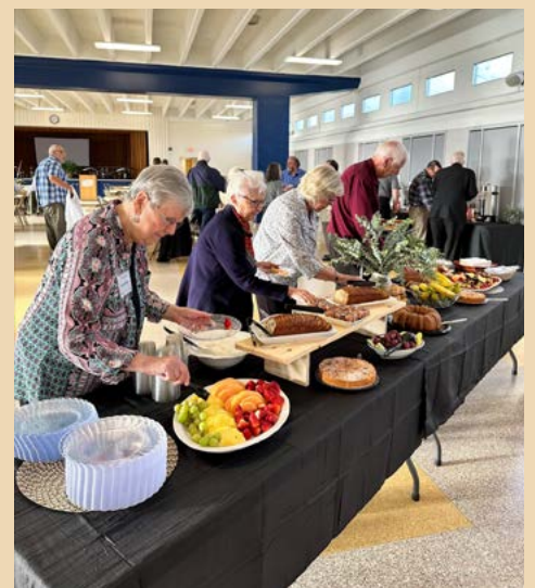
Deacons and their wives enjoy the light breakfast of breads and pastries prepared by the women of St. Gregory the Great Parish.